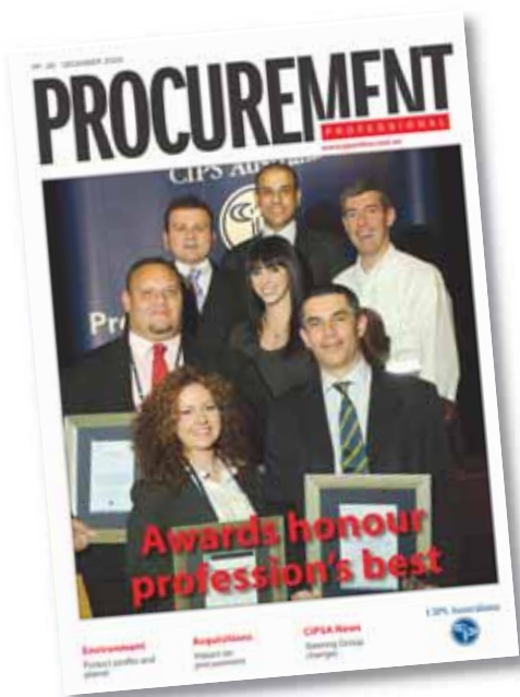
December's Procurement Professional (PP28)

The CIPS Australasia Procurement Professional Awards Dinner will play a central role in the CIPSA Annual Conference on Wednesday 13th October.